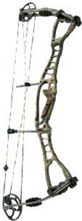
2009 Hoyt Alphashox Thanks to Coyote Springs Outdoors