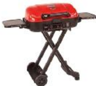
Coleman Grill - Thanks to Gander Mountain