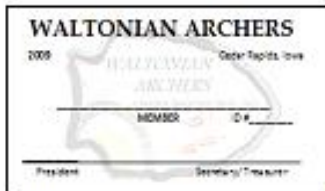
Free Waltonian Archers Membership

Drawing to be held May 16 th 2009 at the Waltonian Archers Silver Broadhead 3-D Shoot Banquet