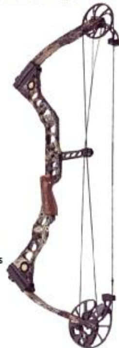
Mathews Outback Thanks to Great Outdoor Traditions