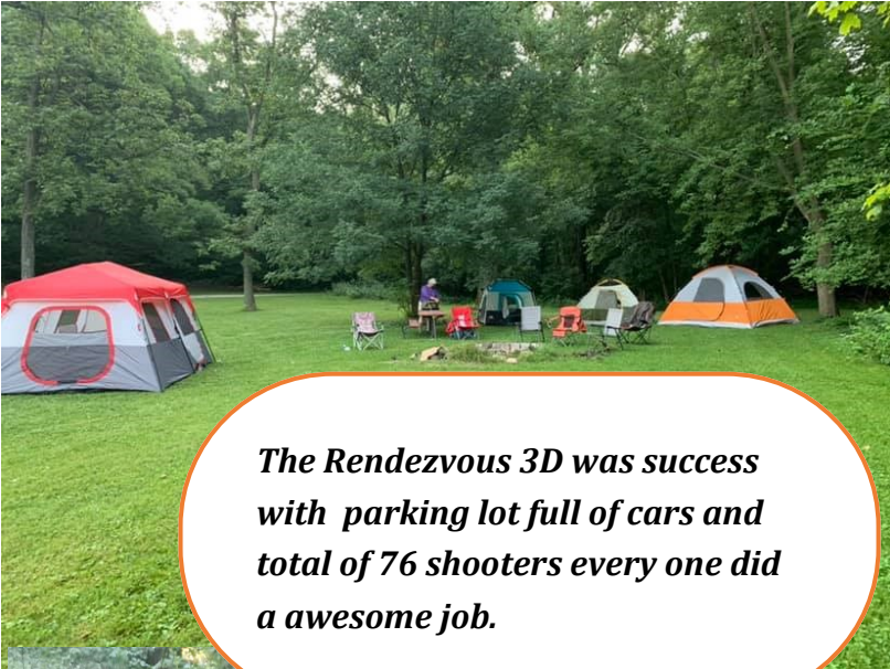
The Rendezvous 3D was success with parking lot full of cars and total of 76 shooters every one did a awesome job.