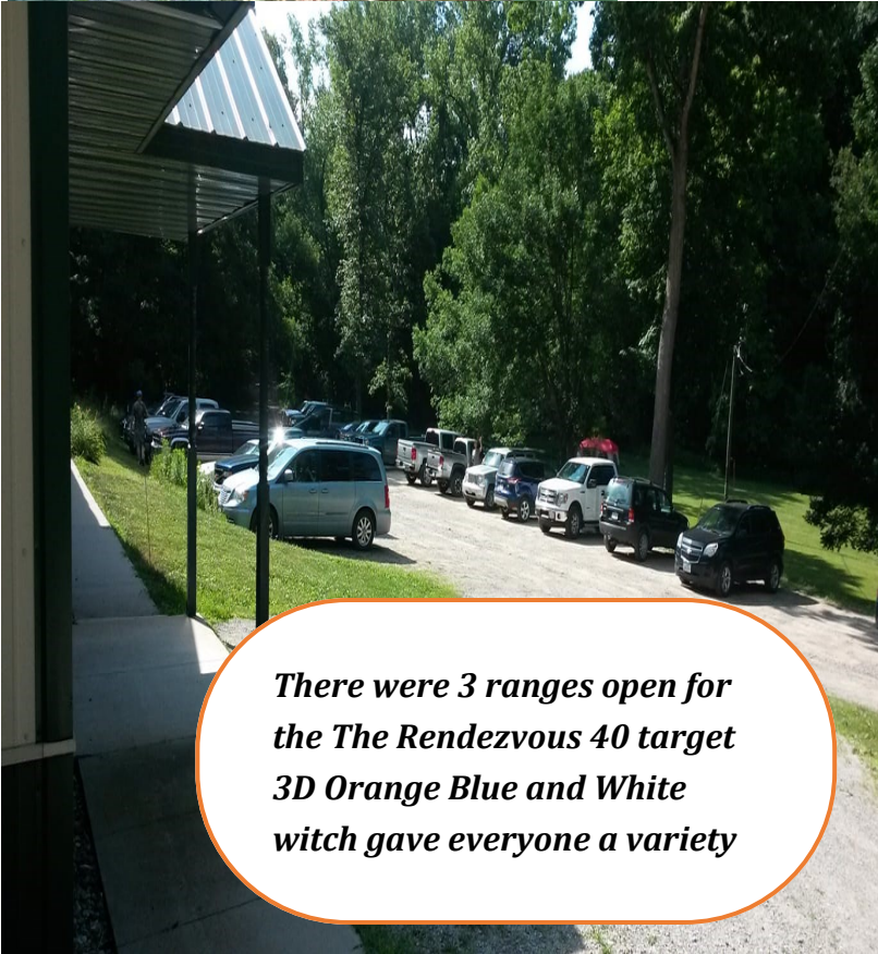
There were 3 ranges open for the The Rendezvous 40 target 3D Orange Blue and White witch gave everyone a variety